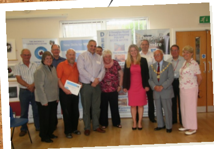
At Market Deeping community centre with voluntary groups.