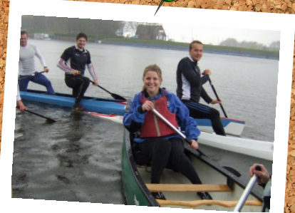
At the National Watersports Centre in Nottingham