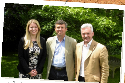
With Sir Clive Loader and Alan Duncan MP at a summer garden party in Rutland & Melton