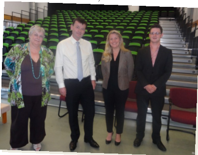
Visiting the iCon Centre in Daventry