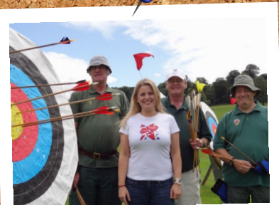
At Kedleston Hall with members of Derbyshire Archery Club