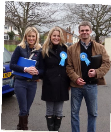
Campaigning earlier this year in Daventry