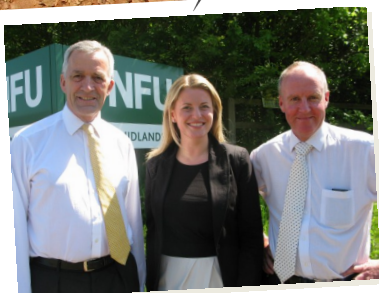
At the NFU EU Conference I hosted at Uppingham