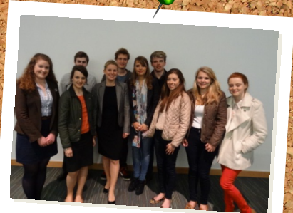
Questiontime with pupils of Oakham School