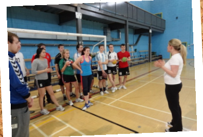
Talking to students at Lincoln University Handball Club