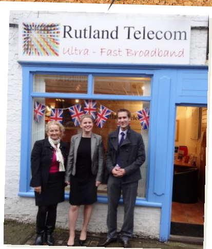
Visiting Rutland Telecom in Oakham