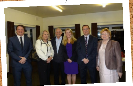
With members of Gedling Conservative Association