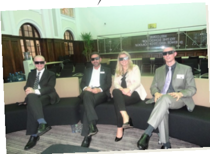
Watching 3D Modelling at Nvision in Northampton

Nvision is at the cutting edge of what is possible, and I hope that this investment of EU taxpayers' money is seen as a great boost to the potential growth of the region.