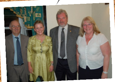
At Wellingborough Conservatives' Policy & Pizza' night