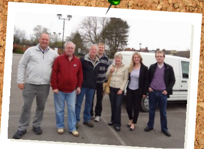
Campaigning earlier this year in Darley ward in Derby