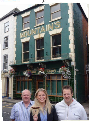
At Mountain's Butchers in Boston