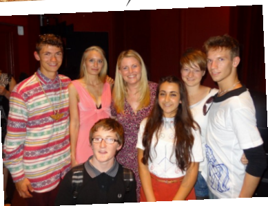
At Mighty Creative's EU Culture Exchange in Nottingham