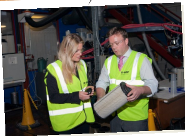
On a visit to BASF in Alfreton