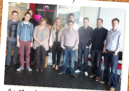
At Northampton Uni's Portfolio Centre to meet Entrepreneurs