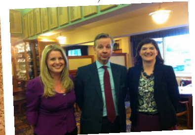
In Loughborough with Michael Gove MP and Nicky Morgan MP