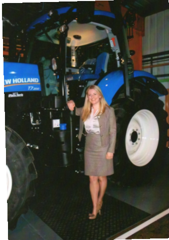
On a visit to TMAT in Chesterfield