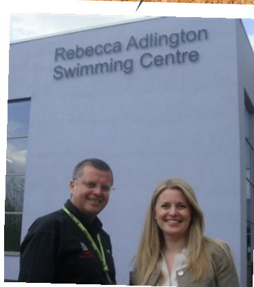
At the Rebecca Adlington Swimming Centre in Mansfield