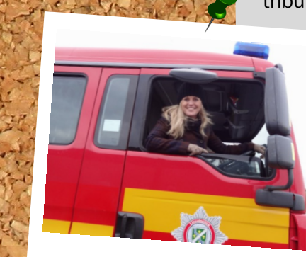
Visiting Lincolnshire Fire Service

the Women2Win attended the first regional women's conference at organisation - and many Morley Hayes Golf Club,