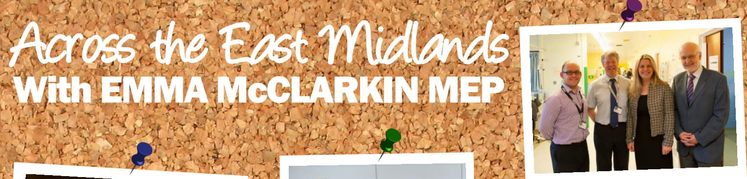
Discussing clinical trials at the Children's Brain Tumour Research Centre in Nottingham