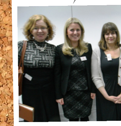
At a Women in Politics' event in Nottingham earlier this year