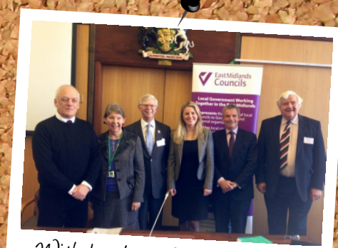
With leaders of councils from across the East Midlands